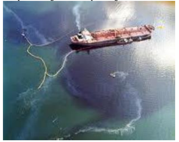
Fig. 4 Exxon Valdez

Exxon Valdez failed on the Bligh reef in Prince William Strait, in Alaska, on March 24, 1989. 37,000 tons of oil was discharged and spread over a very large area. Dispersing spraying was fairly small, and there were attempts to burn the oil stain, but at sea the actions taken focused on recovering crude oil and preventing it from expanding.