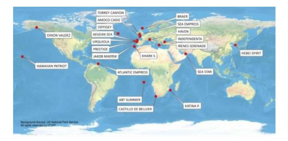
Fig. 1 Location of the most important oil products' spillages [ITOPF Oil Tanker Spill Statistics, 2012]