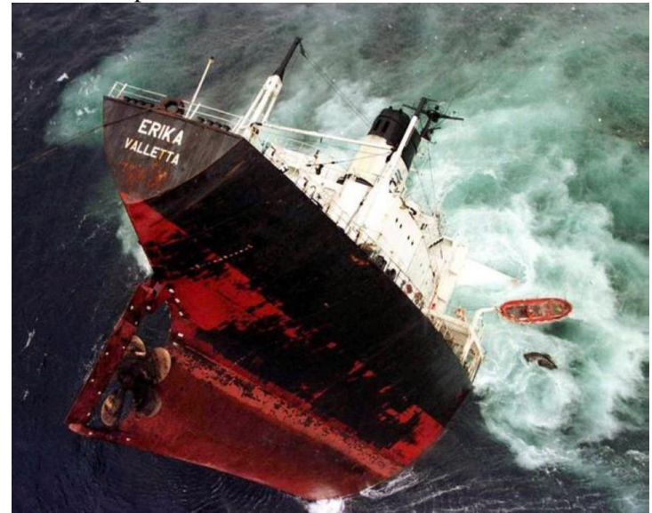
Fig. 5 Erika (http://www.wrecksite.eu/wreck.aspx?31185)

estimated that less than 3 per cent of the total discharged was recovered during the sea surface collection operation.