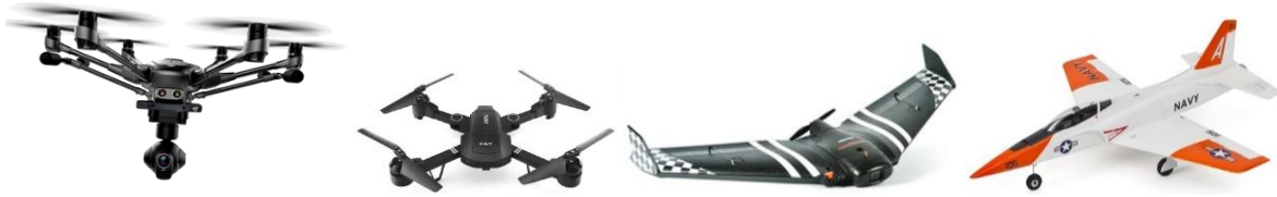
Figure 1. Examples of commercially available UAVs (multicopters, fixed-wing)

or naval convoys on the move. In 2017, three teams, led by Dynetics Inc., Saab Defense and Security USA, have been selected to work on the first out of three phases of the program. [2]