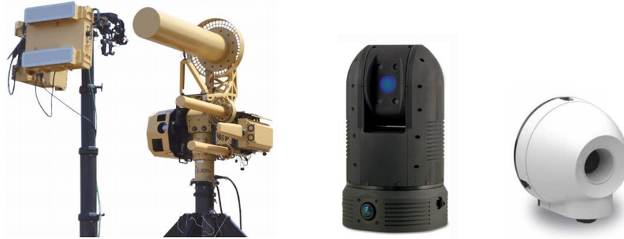
Figure 2. Counter-UAV systems (from left to right: AUDES, Beam 220 and WideAlert)

Another commercial solution is the Drone Detection System developed by the German company Aaronia AG. It is a radio-frequency emissions monitoring system, covering a frequency range from 20 MHz to 20 GHz. Apart from its detection functions it also has jamming capabilities. For both detecting and jamming communications, the system uses an array of log-periodic antennas, called IsoLOG 3D. The system can be deployed as mobile or fixed command center and has a detection range of 1 km. The software provided with it is capable of analyzing any type of communications and automatically localizing an UAV entering the supervised area.