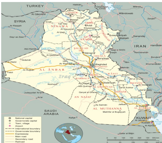
Figure 1. Subunit area of military operations[5] Appropriate distances between localities in the operations area are given in the table below [4]:

Based on this information, it is desired to determine how the movement should be organized between localities Al Faw and Dahuk so that the subunit reach in a short time the destination and pass through the town of Baghdad.