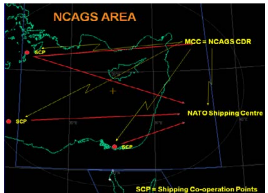
Figure 2. NCAGS area organization

Case study - an example of how a military commander may establish his NCAGS organization (figure 2).