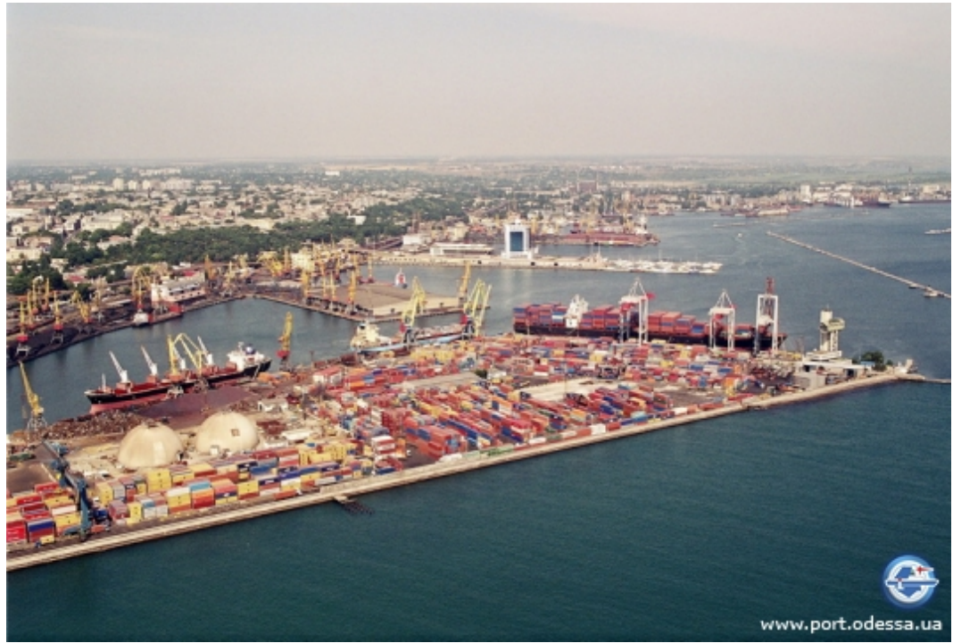
The view of the port

The port of Odessa is one of the largest ports of the Black and Azov Seas basins, located in the north-western part of the Black Sea on the historically founded merchant ways between East and West. The port is a leader in cargo handling volumes among the ports of Ukraine and the largest passenger port on the Black Sea.