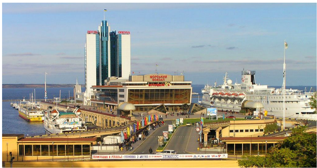
The view of Odessa Passenger Terminal

Modern design and technical equipment of Odessa Passenger Terminal bracket it among the corresponding European and world terminals. Its location in the historical center of Odessa is not accidental. It faces the world known Odessa emblems, the Potemkinskaya Stairs and the Monument to Duke de Richelieu (the first Governor-General of the region). Odessa Marine station joins these famous architectural city-symbols. Marvelous architectural ensembles, historical monuments, smooth climate of the south and abundance of entertaining establishments, proximity of the airport (8 km) and central railway station (4 km) attract to Odessa tourists from all over the world.