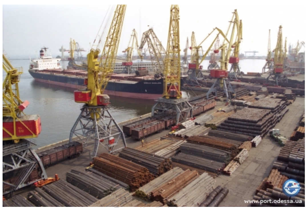
The metal handling in the port

Open metal storage area of 150,000 sq. m. allows to store up to 1 mln. ton of metal simultaneously. It is possible to allocate up to 40,000 tons of metal products in warehouses with total space of 18,000 sq. m. A covered shed with area of 620 sq. m. is also served to the clients.