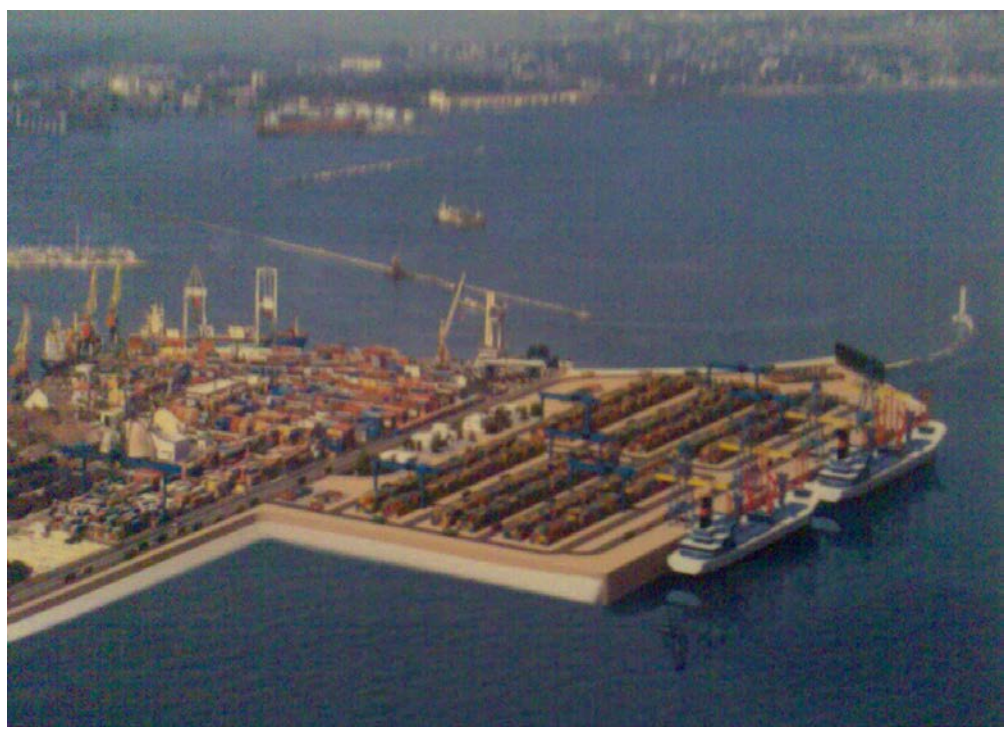
The plan of the new container terminal HPC-Ukraina