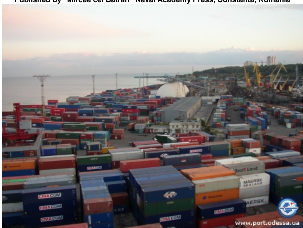
The view of one of the container terminal in the Port of Odessa

The reached efficiency of cargo work for a technological line is 23-26 containers per hour, for one vessel – 75 containers per hour. They render the services of stuffing/unstuffing cargoes into/out of containers on the port territory.