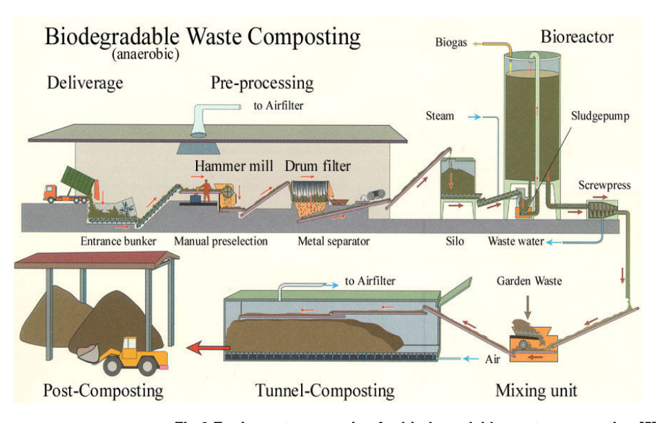
Fig.2 Equipment succession for biodegradable waste composting [5]

The biodegradable Waste can be transformed in compost and biogas in a specifically plant like in the figure no.2. For the first the waste material is sorting and then milling in a shredder (hammer mill) in small pieces. Then, the small pieces of organic waste are mixing in a revolving rotting drum.